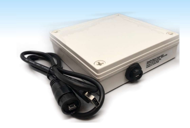
OPS7243 Radar Sensor